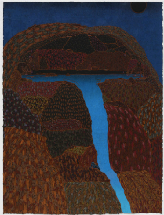
Lydia Baker Another Day | colored pencil and wax pastel on paper, 40 x 30 inches